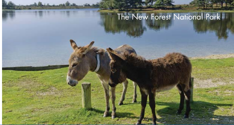
The New Forest National Park

All entrance fees are included in the course fees