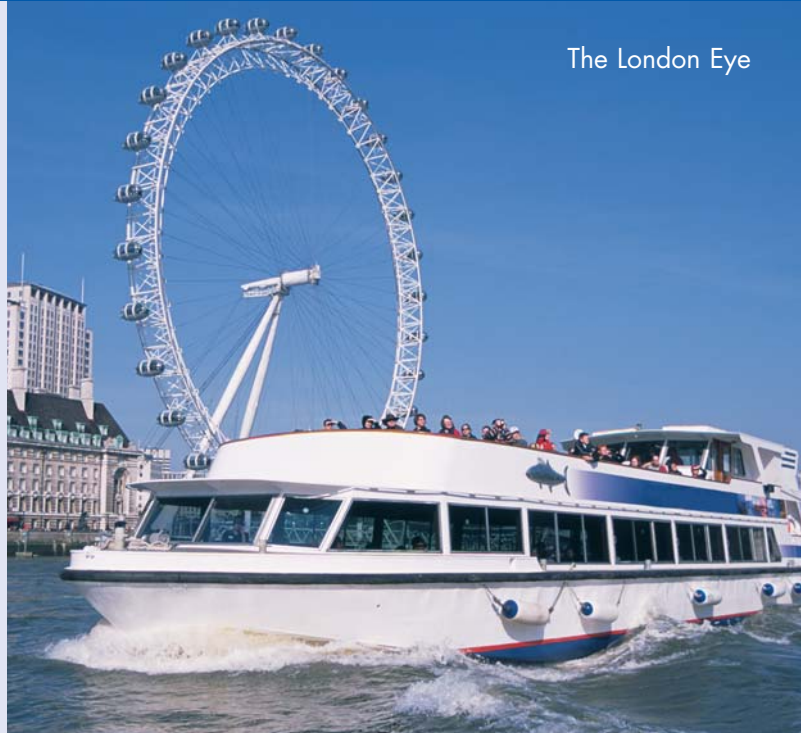
The London Eye

The full-day excursions, included in the fees, take place on Saturdays. On Sundays, full-day excursions and on weekdays half-day excursions are organised to interesting destinations at extra cost.