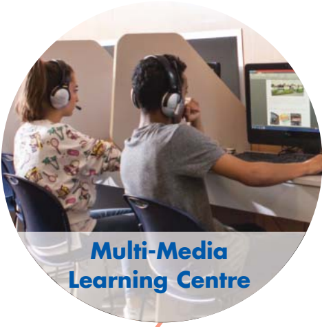
Multi-Media Learning Centre