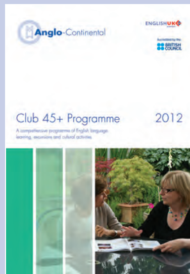
Club 45+ Programme