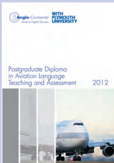
To be introduced in 2012 Postgraduate Diploma in Aviation Language Teaching and Assessment

Member of BUSINESS ENGLISHUK for Professional Training