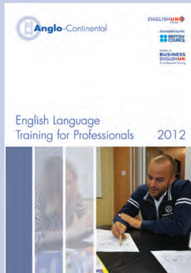
Professional Training Prospectus