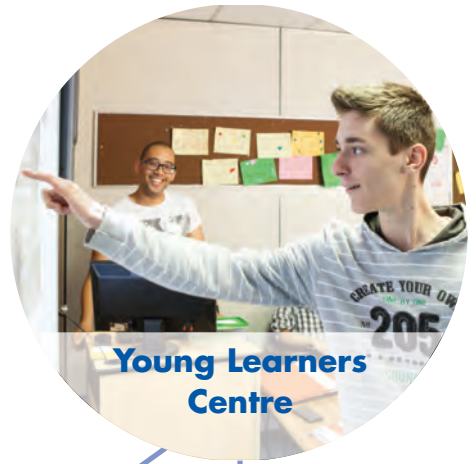
Young Learners Centre