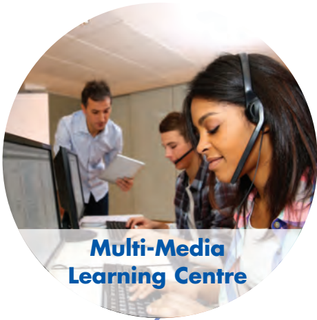
Multi-Media Learning Centre