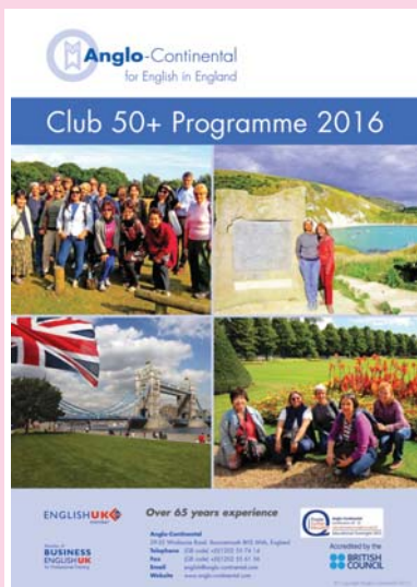
Club 50+ Programme

Over 65 years experience in teaching English to the world!