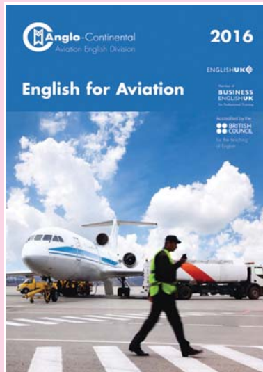
Aviation Prospectus (available online only)