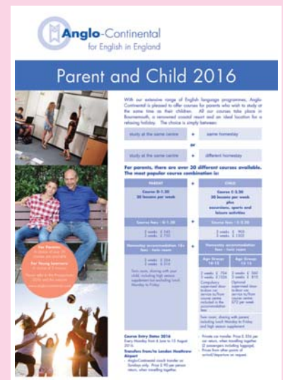
Parent and Child Programme

Over 65 years experience in teaching English to the world!