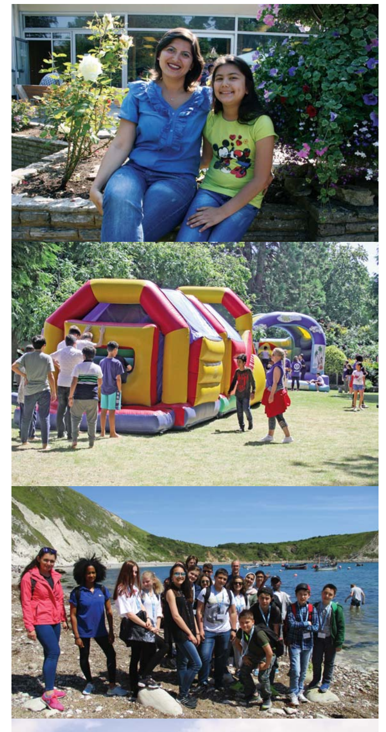
English + Football Courses

If the parent and child wish to follow the same excursion on a Saturday, they may book one of the specified Anglo-Continental adult or vacation excursions. In this event, whilst the parent will pay the published price, the child may go free of charge as it will be considered a substitute for the scheduled Young Learners excursion.