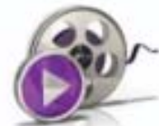
DVDs and videos