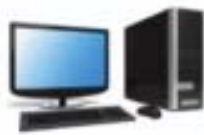
Computers and CD-ROMs