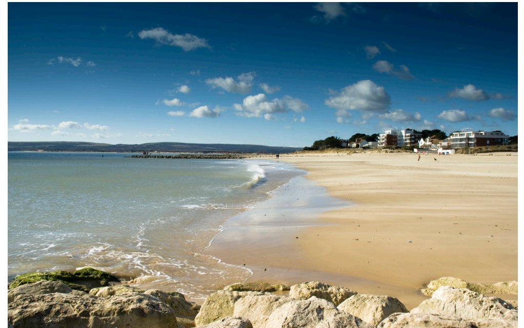
Swim, sail or simply enjoy the fresh seafood at Poole Quay and Sandbanks Beach