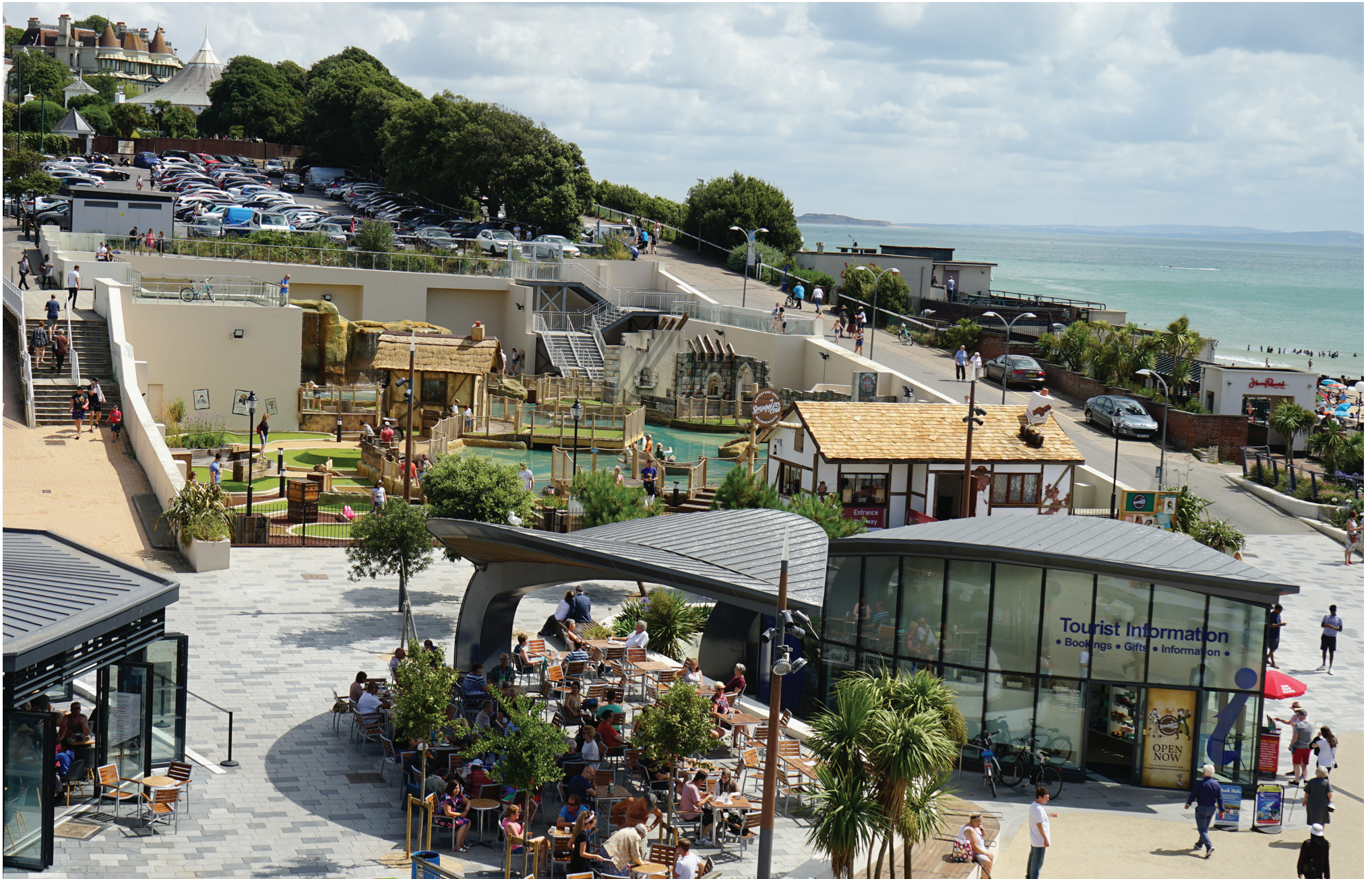
The Tourist Information Centre and Smugglers Cove adventure golf course can be found on the Bournemouth Pier approach