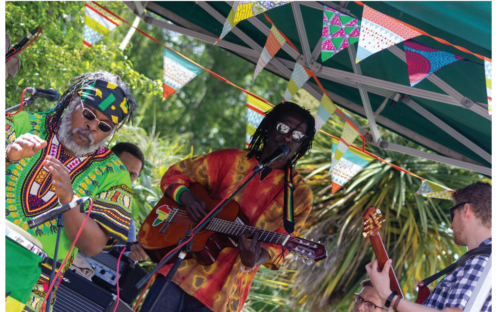
Africa comes to Bournemouth and International Food and Drink Festivals