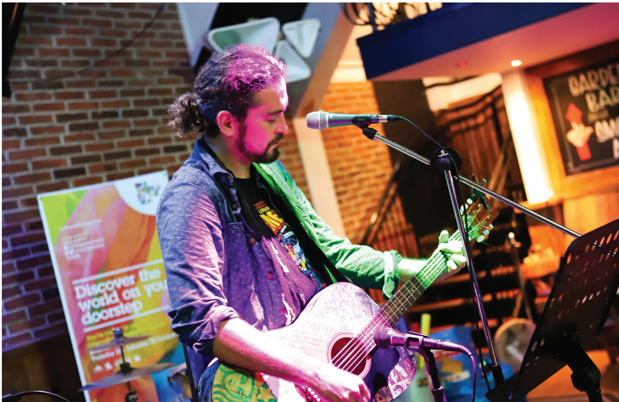
One World by the Sea International Festival