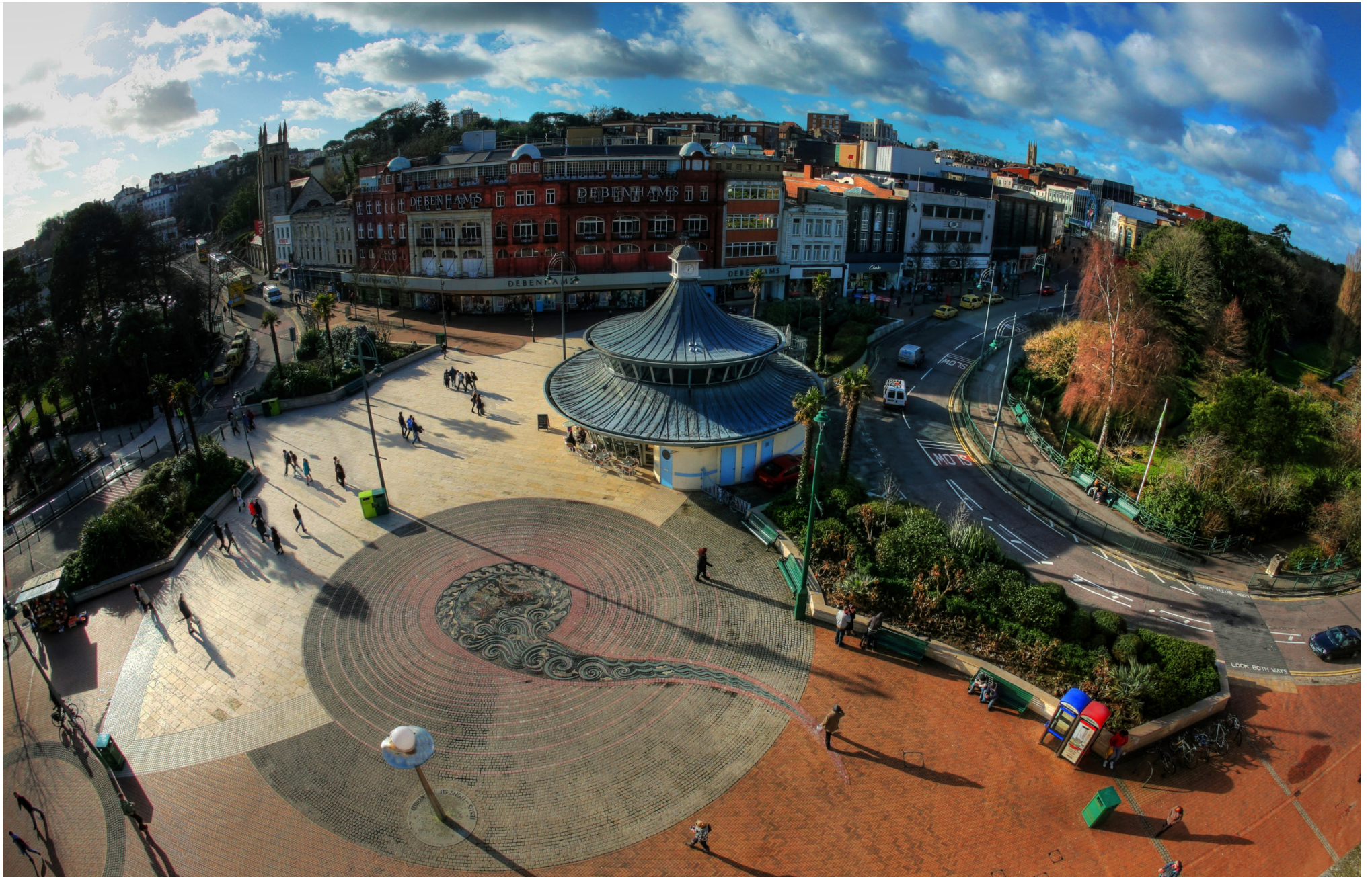
Bournemouth Square, located minutes away from the beach and Lower Gardens