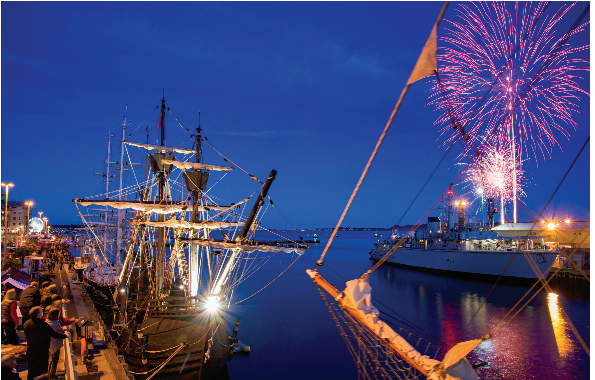
Summer brings a whole spectacle of events to Poole Quay. Enjoy stunning weekly firework displays, live entertainment and the breathtaking views across the harbour