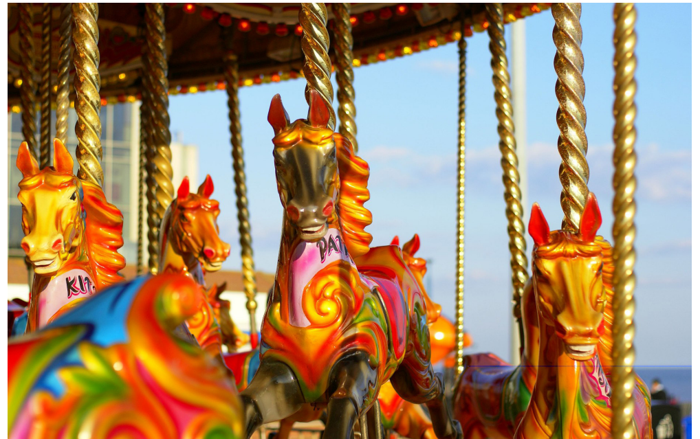
Bournemouth offers all the traditional seaside fun you'd expect to find as well as so much more