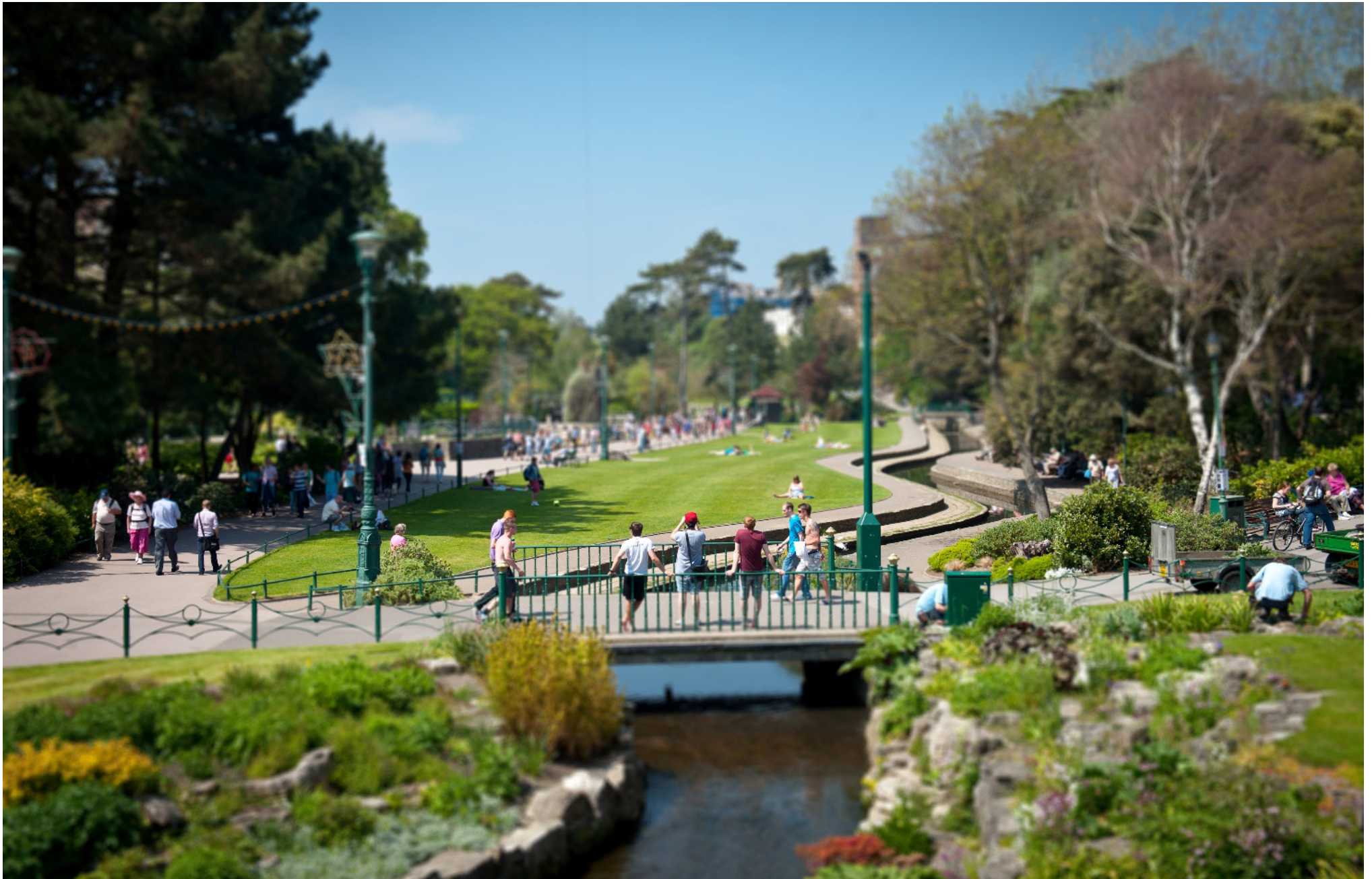
The Lower Gardens in Bournemouth are only a five minute walk from the main shopping centre, the beach and the pier