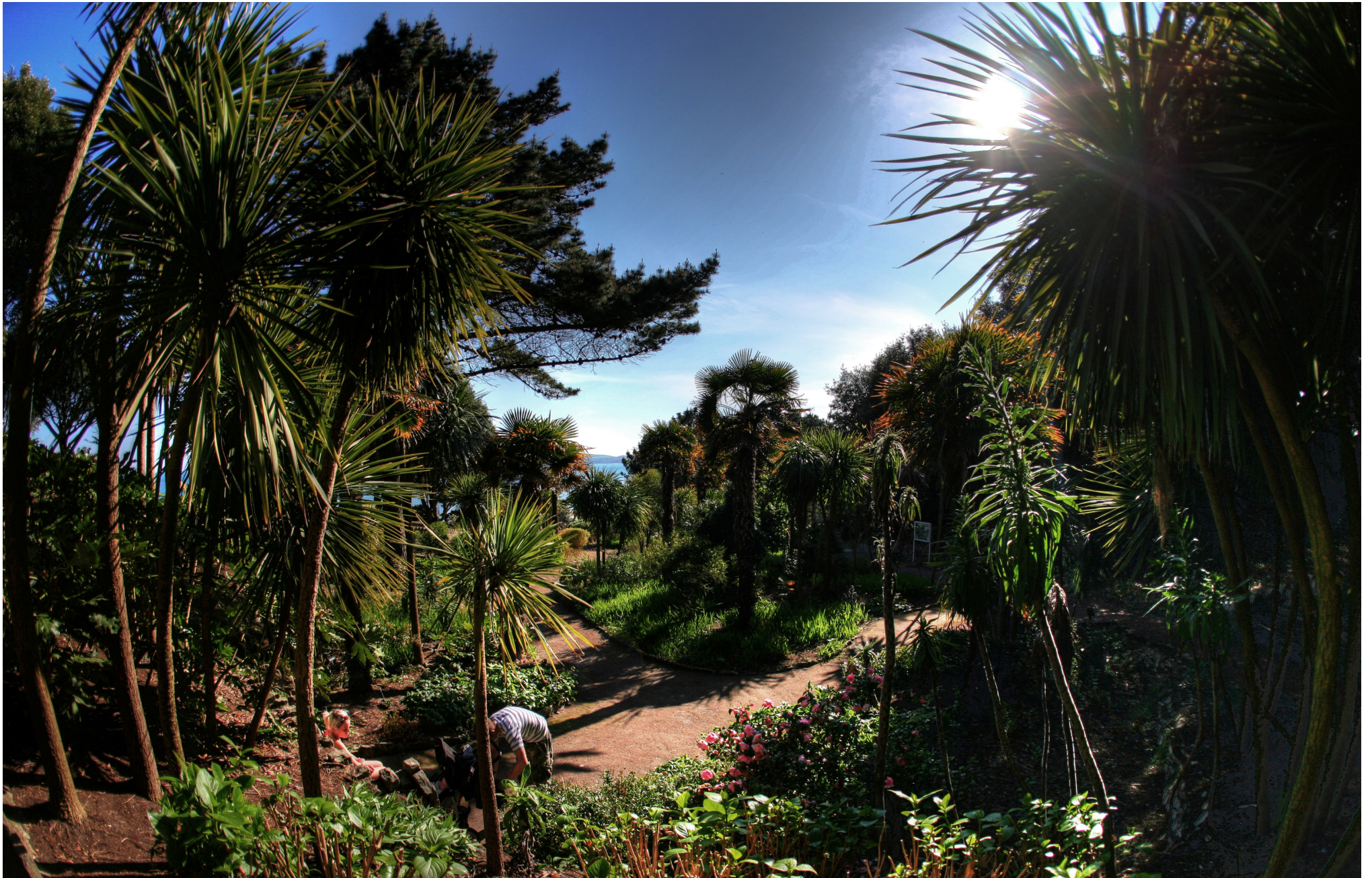
The glorious Alum Chine Gardens: with the Blue Flag beach below, the gardens have become renowned for their award-winning facilities, striking design and stunning views