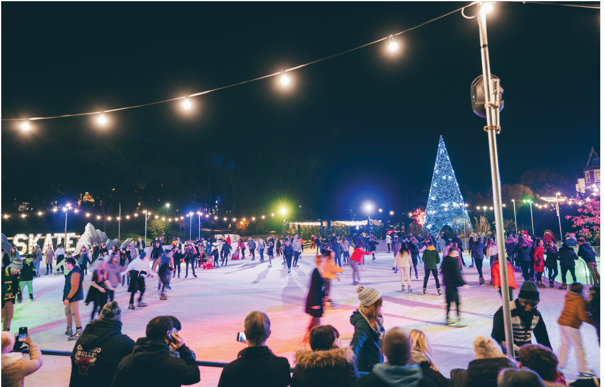
Bournemouth Christmas tree wonderland, Christmas market and ice skating rink