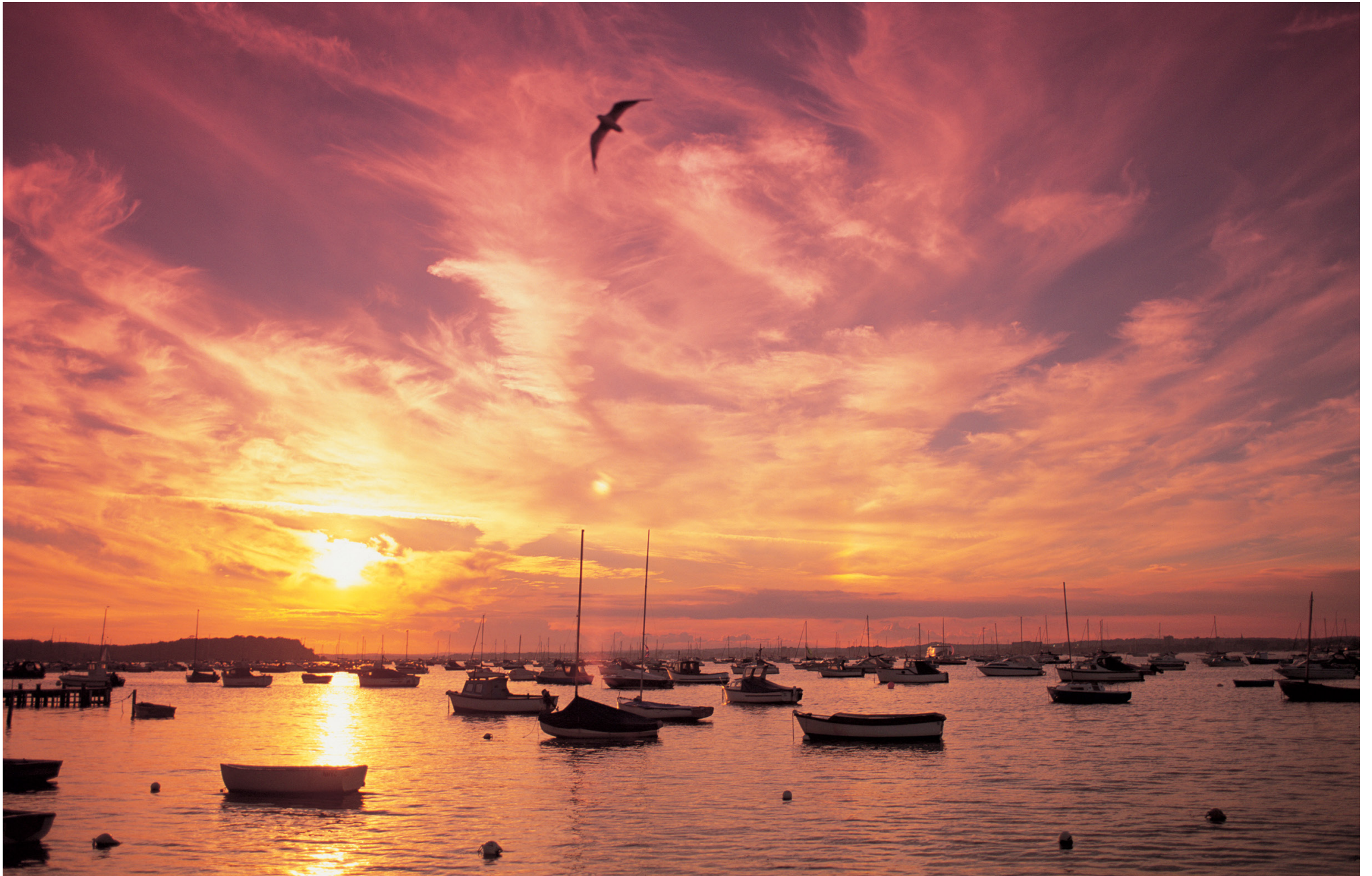
The sun setting over the stunning Poole Harbour