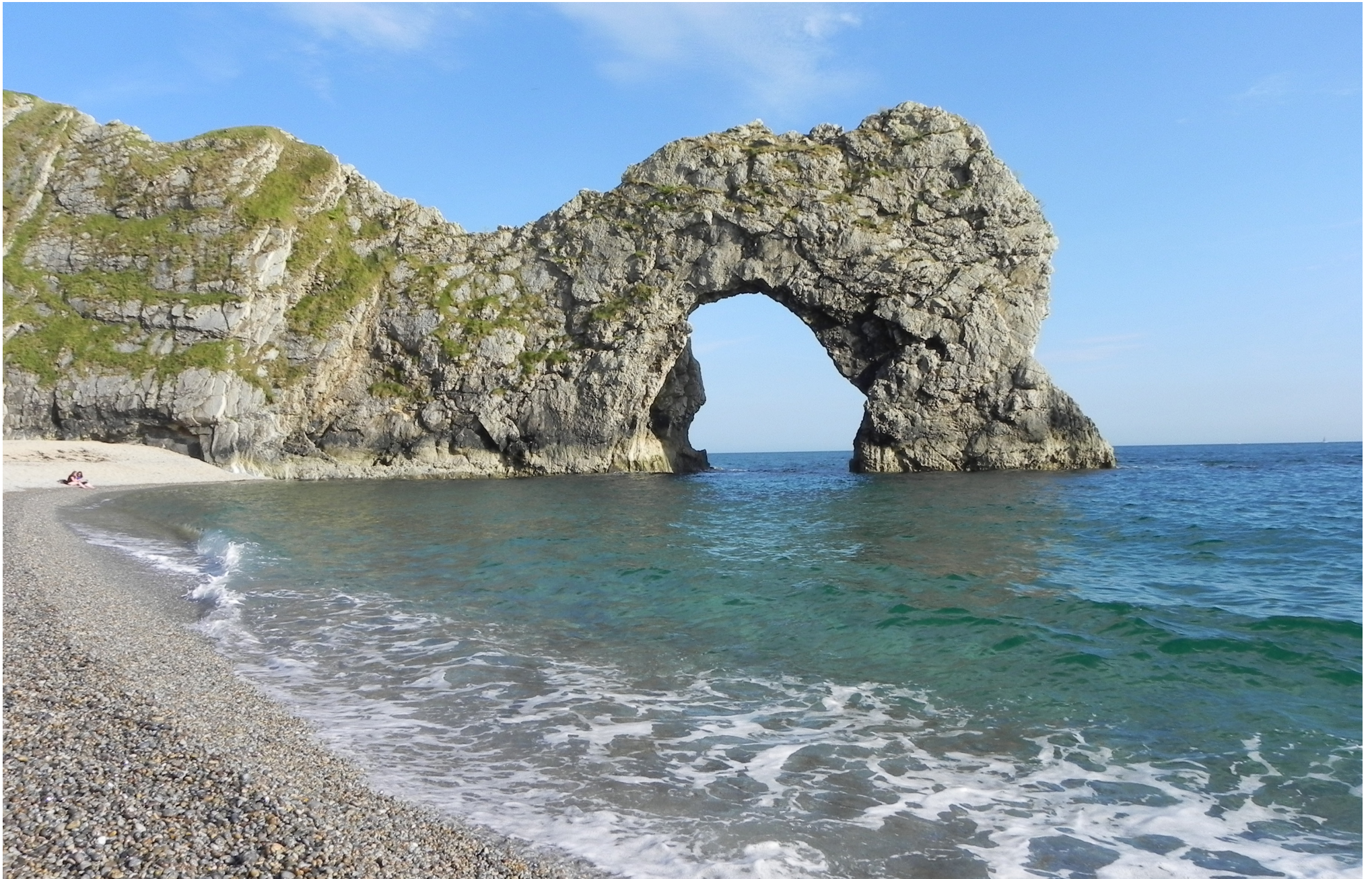
On Dorset's Jurassic Coast lies the 140 million year old limestone formation of Durdle Door. A popular visitor spot, the heritage site lies 20 miles west of Bournemouth and makes for the perfect day trip