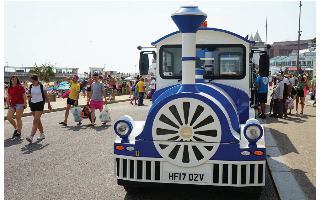
Bournemouth beach stretches across seven miles of golden sands. Stroll, cycle or hop aboard the land train to see the best of it!