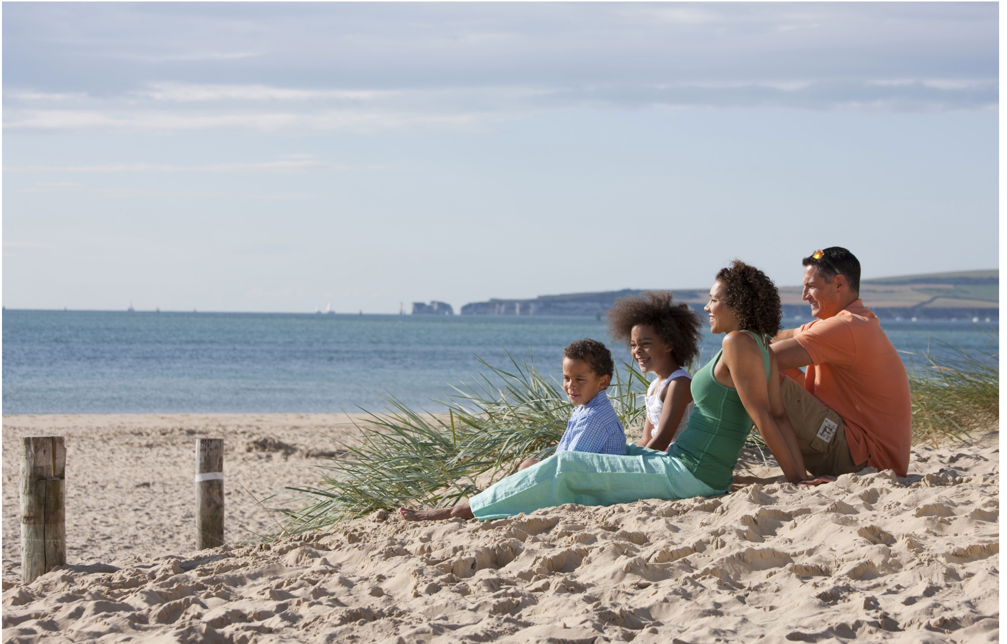
The Isle of Purbeck is located west of Bournemouth, with natural beauty spots such as Old Harry Rocks (pictured)