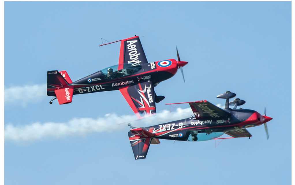
Day and night Bournemouth Air Festival delights locals and visitors with four days of jaw-dropping stunts, incredible jets and display teams