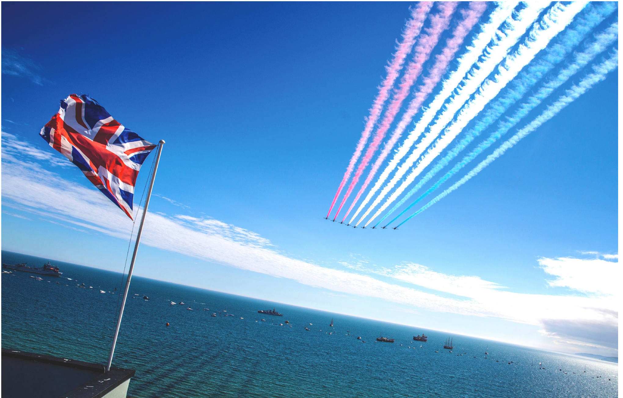
Every August, the award winning Bournemouth Air Festival offers one of the largest air displays in the country