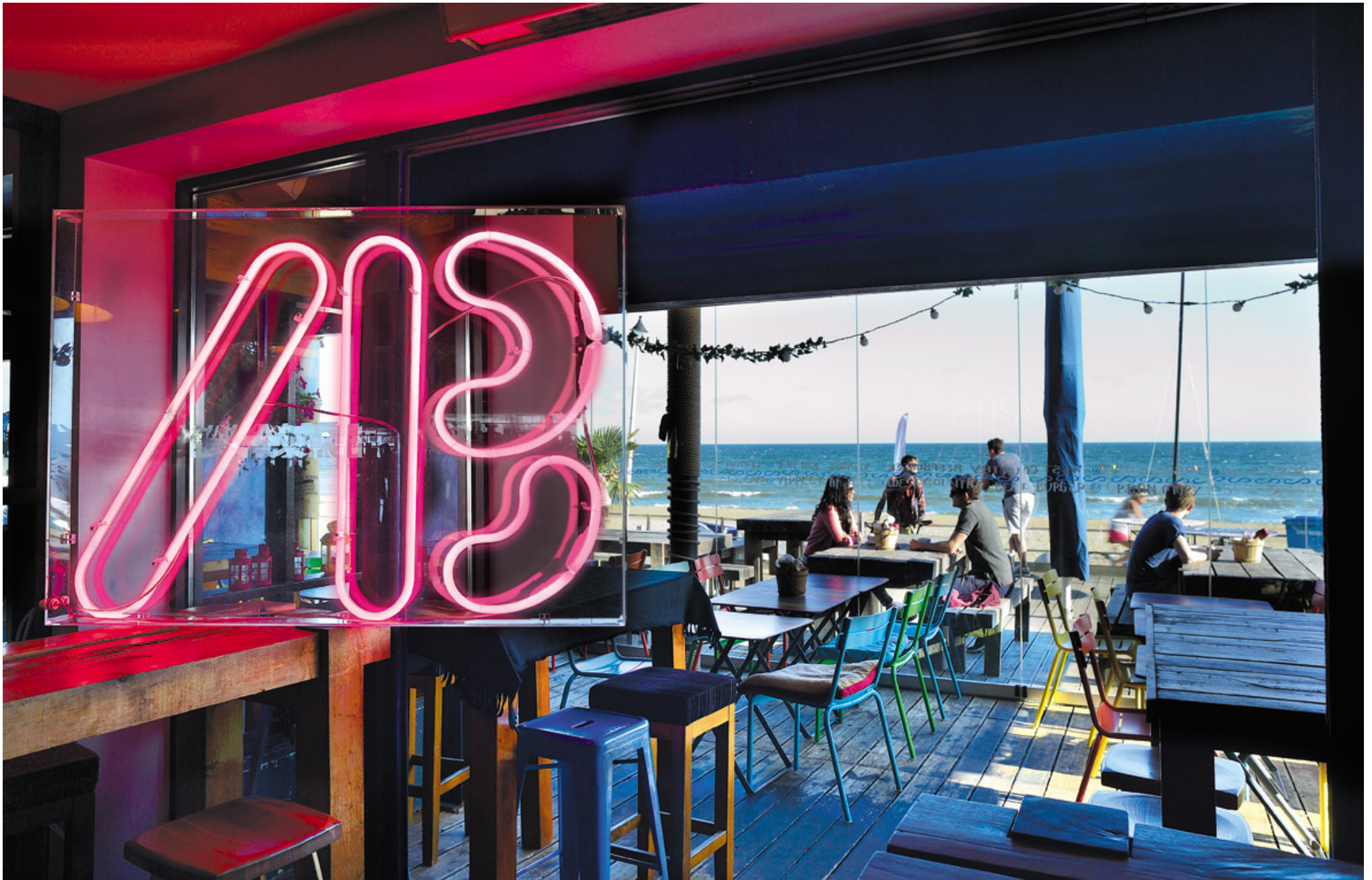
Arts Bournemouth exists to support and develop the arts in Bournemouth and delivers the annual Bournemouth Arts by the Sea Festival