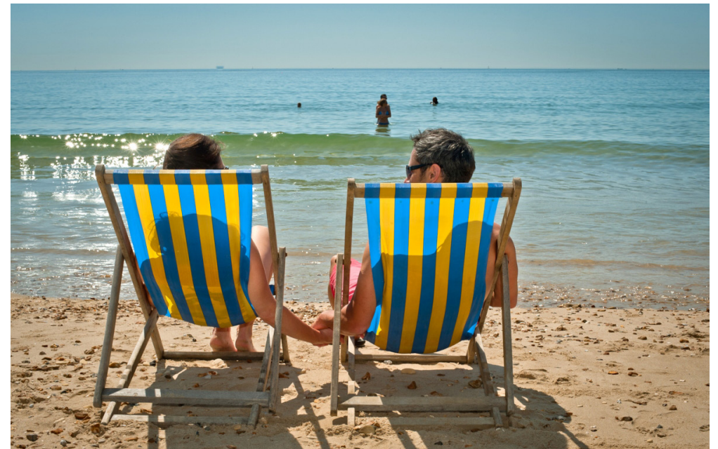
The beach huts in Bournemouth and Poole are available to rent all year round