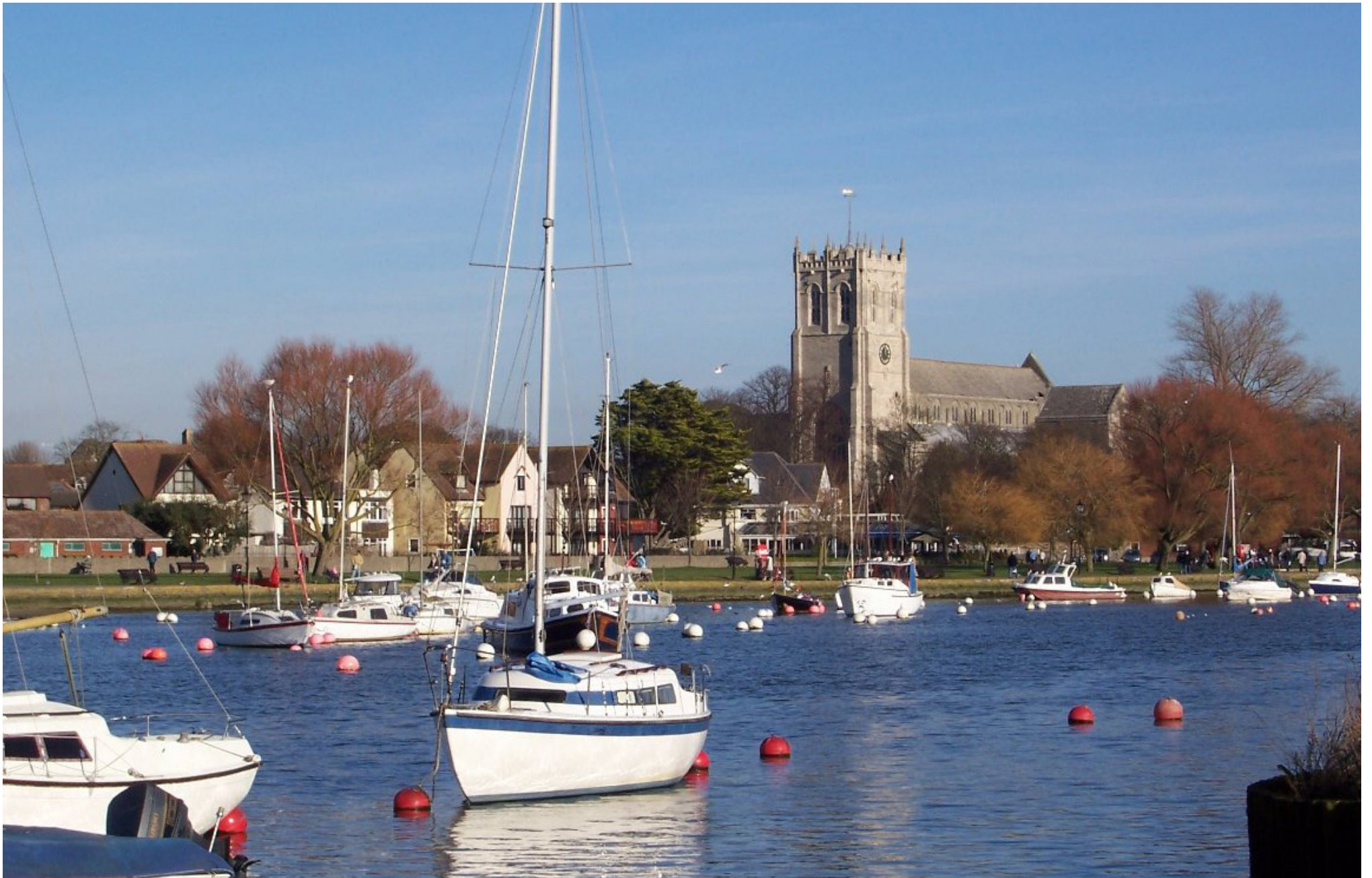
The neighbouring quayside town of Christchurch