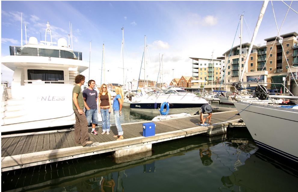
The pretty harbour town of Poole