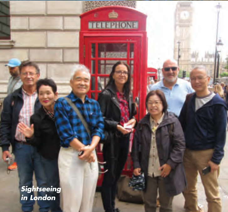
Sightseeing in London