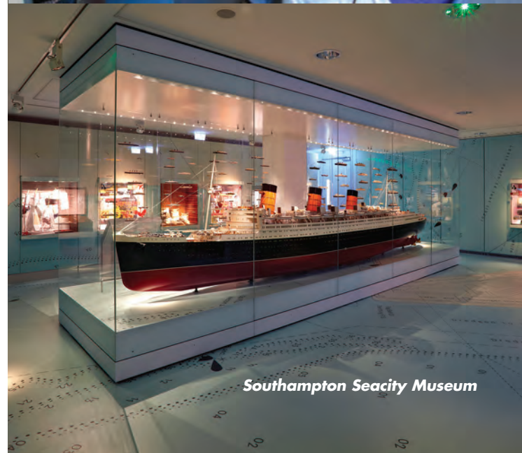
Southampton Seacity Museum

We reserve the right to make changes to the programme if required.