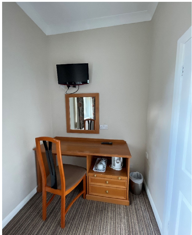
Study area and TV