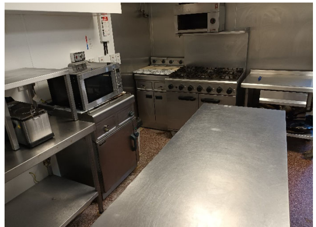
Kitchen - Guests can cook their own meals