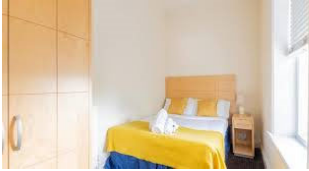
Single Room – en-suite