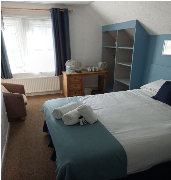
Other room – en-suite