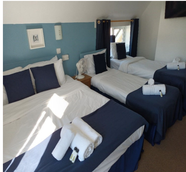
Other room – en-suite